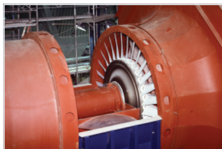
Installed main bearing assembly