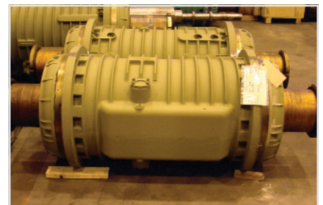
Main bearing assembly

In connection with upgrade to a new lubrication system the bearing house (upgraded or new) will as a standard solution be provided with frictionless seals in both ends of the bearing house to avoid leakage and secure a minimum of wear on the sealing parts.