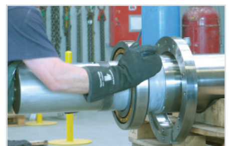
Shaft for main bearing assembly