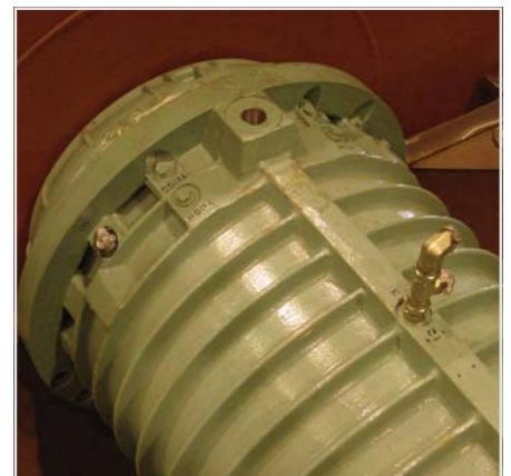
Main bearing assembly - TLT

Regarding vibration instrumentation for MBAs with roller bearings from 1980s and older, please consult Howden.